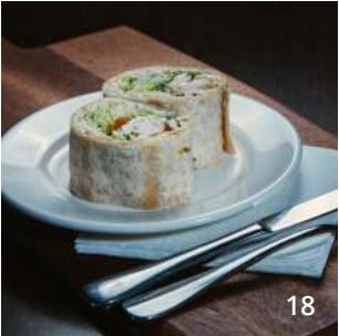
Qty (Minimum order of 10 per item)