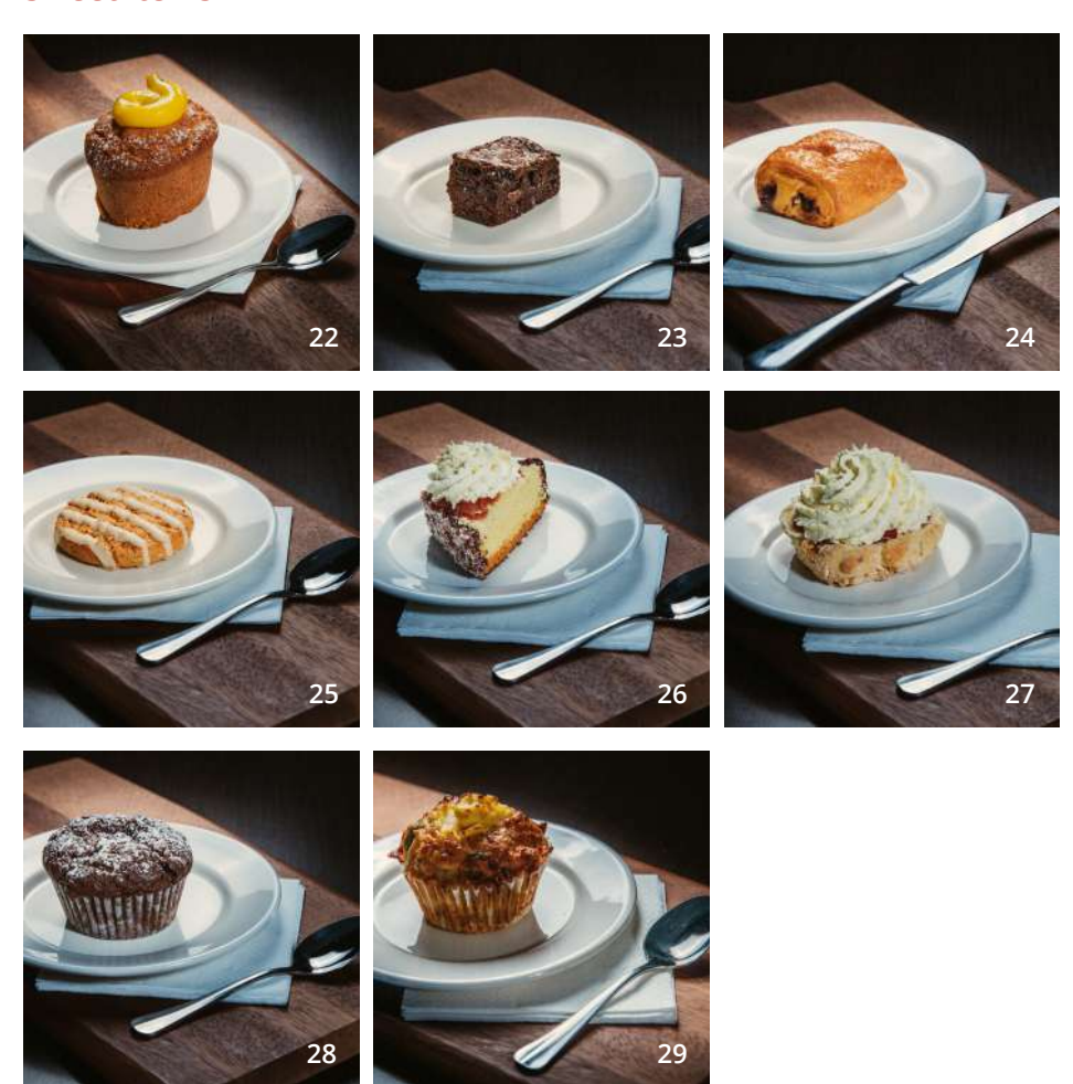
Qty (Minimum order of 10 per item)