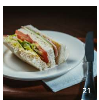
Qty (Minimum order of 10 per item)