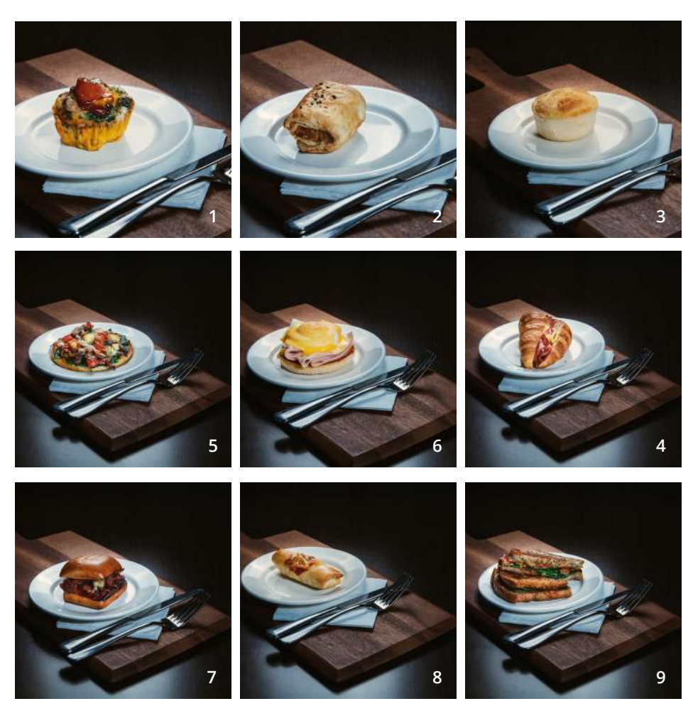
Qty (Minimum order of 10 per item)