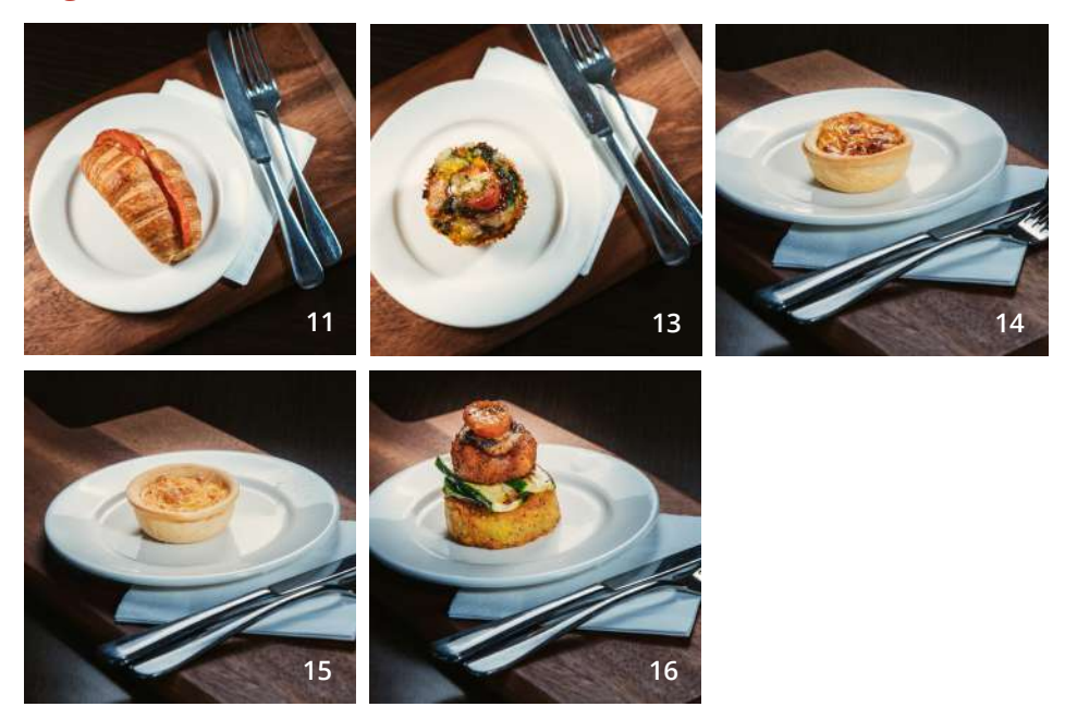
Qty (Minimum order of 10 per item)